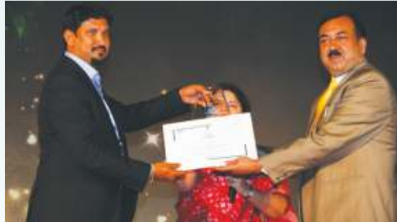
Medical Value Travel Specialist Hospital (Cardiac Surgery) Winner: Narayana Institute of Cardiac Sciences