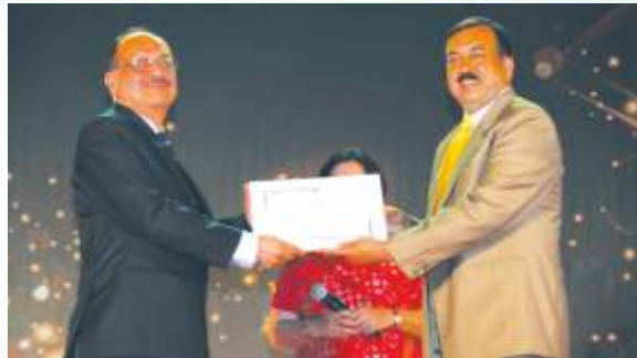
Medical Value Travel Specialist Hospital (Paediatric Cardiac Sciences) Special Organizer's Mention: Jaypee Hospital