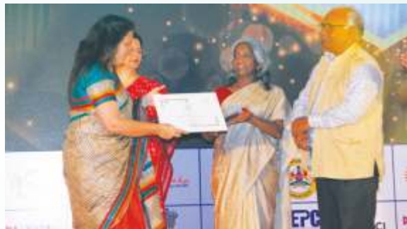
Medical Value Travel Specialist Hospital (Heart Transplant) Winner: Fortis Malar Hospital Ltd.