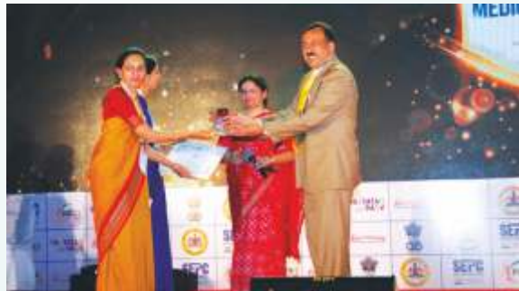
Wellness Centre of the Year Runners Up: SOUKYA International Holistic Health Centre