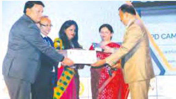
Medical Facilitator of the Year Runners Up: Shinon Global Consultancy