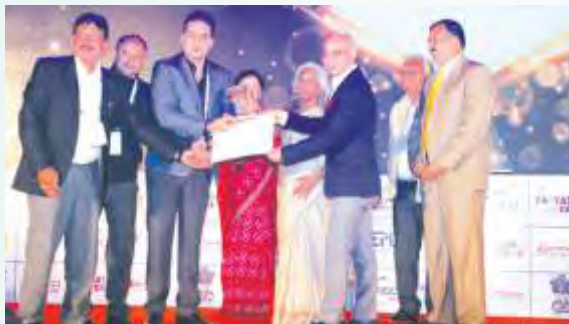
Medical Value Travel Specialist Hospital (Kidney Transplant) Winner: Indraprastha Apollo Hospitals, New Delhi