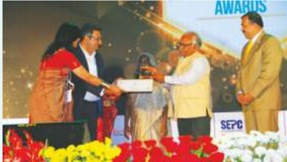
Medical Value Travel Specialist Hospital (Liver Transplant) Winner: Gleneagles Global Hospitals