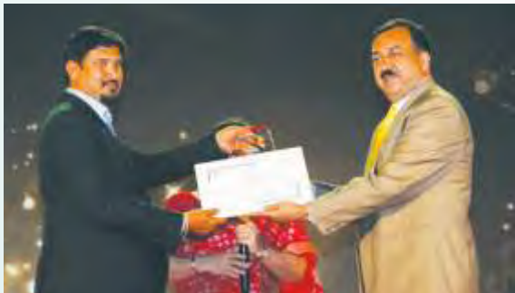
Medical Value Travel Specialist Hospital (Oncology) Winner: Mazumdar Shaw Medical Center