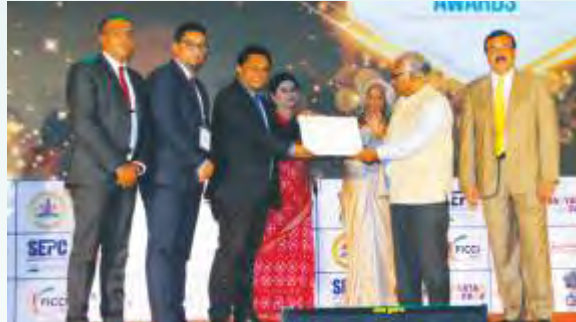
Medical Value Travel Specialist Hospital (Liver Transplant) Runners Up: Indraprastha Apollo Hospitals, New Delhi