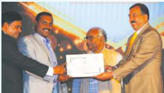
Medical Value Travel Specialist Hospital (Bone Marrow Transplant) Winner: Apollo Hospitals, Chennai