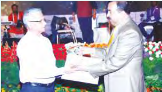
Medical Value Travel Specialist Hospital (Neurosciences) Winner: Paras Hospital