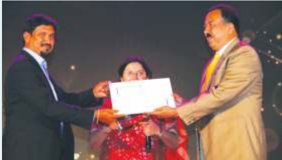
Medical Value Travel Specialist Hospital (Intervention Cardiology) Winner: Narayana Institute of Cardiac Sciences