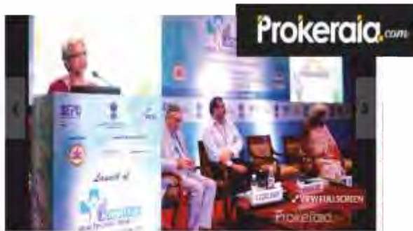
New Delhi, Commerce Secretary Rita Teantia addresses during the launch of 'Advantage Healthcare India 2017' in New Delhi on Aug 11, 2017.