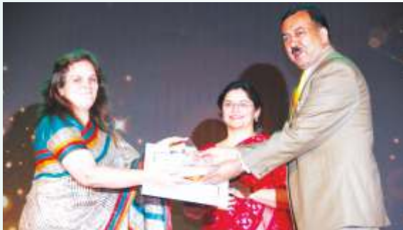
Medical Value Travel Specialist Hospital (Paediatric Cardiac Sciences) Winner: Fortis Hospital, Mohali